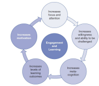
FIGURE 2.7: F-THEN RELATIONSHIPS